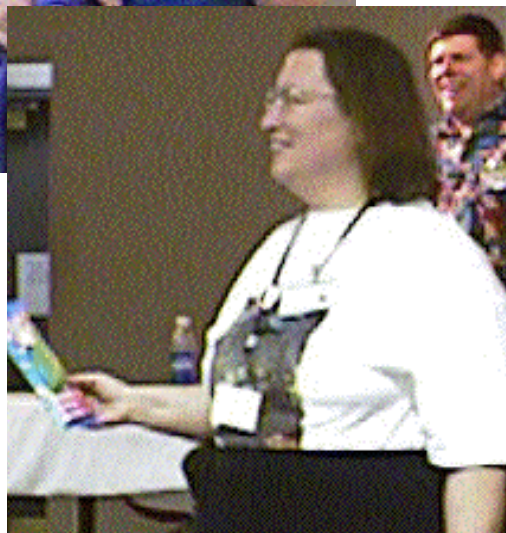
Phoenix, Rebel, and Rubble Winners