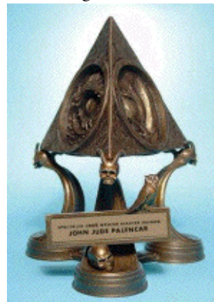
Spectrum Grand Master Award

The Spectrum Awards < www.spectrumfantasticart.com > (for contemporary fantastic art) have been announced. Most of the categories include awards at the Gold and Silver levels.