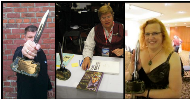
Hugo winners showing off

Full nominating and voting statistics for the Hugos and