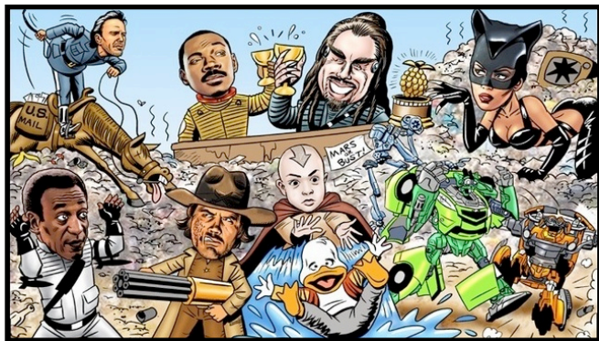
The Postman, Pluto Nash, Battlefield Earth, Catwoman, Leonard Part 6, Jonah Hex, The Last Airbender, Howard the Duck, Red Planet, Transformers 2.

OK, this type of list can be argued over endlessly... but pop culture website <io9.com> has their own idea about what it takes to make a flop sf/f film. Their methodology is said to meld both critical and popular disclaim (as opposed to acclaim). See how many you can pick out from the illo they posted.