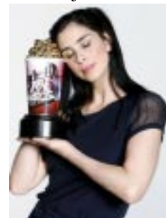
Host Sarah Silverman and the Golden Popcorn

Genre/related noms were dominated by Pirates of the Caribbean: Dead Man's Chest , which received nods in the Best Movie, Best Performance (separately for Johnny Depp and Keira Knightley), and Best Villain (Bill Nighy) categories. The Best Comedic Performance category features two genre films, Night at the Museum (Ben Stiller) and Click (Adam Sandler). My Super Ex-Girlfriend was recognized in the Best Fight category for the Uma Thurman versus Anna Faris showdown. The odd Best Summer Movie You Haven't Seen Yet category has four genre noms, for Fantastic Four: Rise of the Silver Surfer , Evan Almighty ,