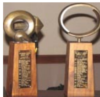
Sturgeon & Campbell Awards