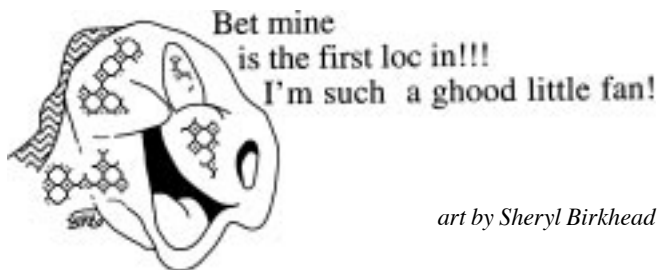
art by Sheryl Birkhead

[The drought is pretty bad here, too. I haven't seen a map lately but back in the late summer and early fall the severity map for the southeast basically looked like a giant target with the bullseye almost right on top of Huntsville. Sorry to hear about your issues with credit cards (continuing into your next LoC) — I did have my main card reissued by the bank proactively a couple of years ago because of a possible security breach, but as far as I can recall I've never had any suspicious activity that did 't turn out to be explainable. Um, one can return candy? Somehow that just doesn't compute! I always make sure to buy stuff I like to make the "chore" of eating the leftovers more bearable ;-) -ED]