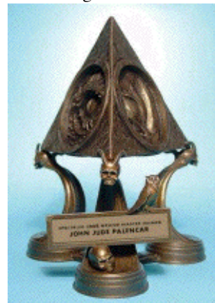
Spectrum Grand Master Award

The Spectrum Awards < www.spectrumfantasticart.com > (for contemporary fantastic art) have been announced. Most of the categories include awards at the Gold and Silver levels.