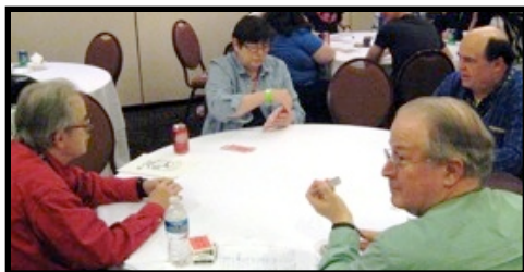
DSC Hearts Tourney, first round