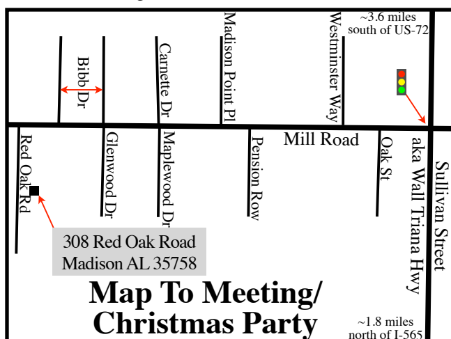
Map To Meeting/ Christmas Party

NASFA meeting dates for three months in 2014 have been