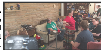
Cookout