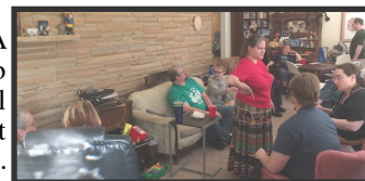
Cookout