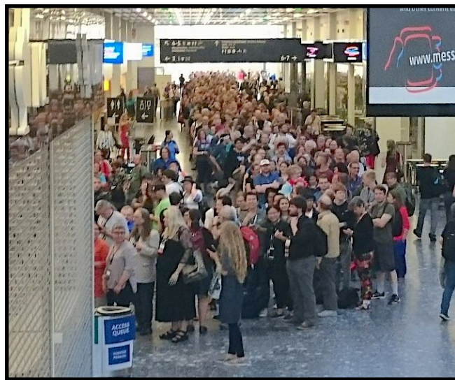
Queuing for the Hugo Awards

The large attendance led to very long lines to get into program items, especially on Wednesday—the first day of the con. In fact, this became the first Worldcon to cut off sales of new memberships/passes in order to control crowding. (The 3 rd issue of the at-con newsletter— Painopiste , or Centre of Gravity —noted that there were 4,759 on site on the first day. Later info via Twitter said the on-site count topped out at 7,119.) They stopped selling full Memberships and Day Passes online, and limited the number of new Day Passes available at the door to 100 per day. [BTW, “painopiste” is a multi-level pun, explained in issue 6 of Painopiste , which is available at < www.worldcon.fi/publications >. -ED]