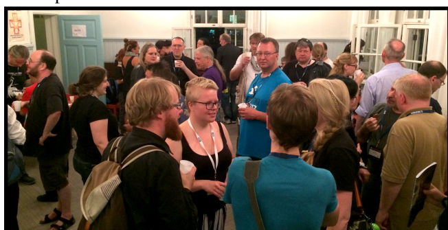
Croatian and Australian party

In short, other than crowding issues it appears that the first Worldcon in Finland was a significant success. Your editor looks forward to hearing or seeing some first-hand “After Action Reports” in the near future.